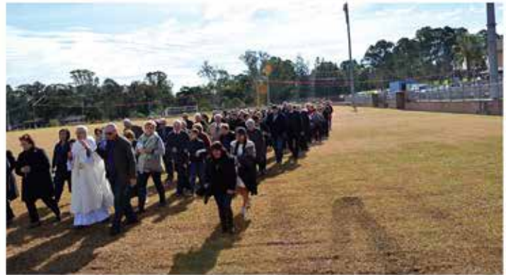
La processione sul campo sportivo del CSI Club