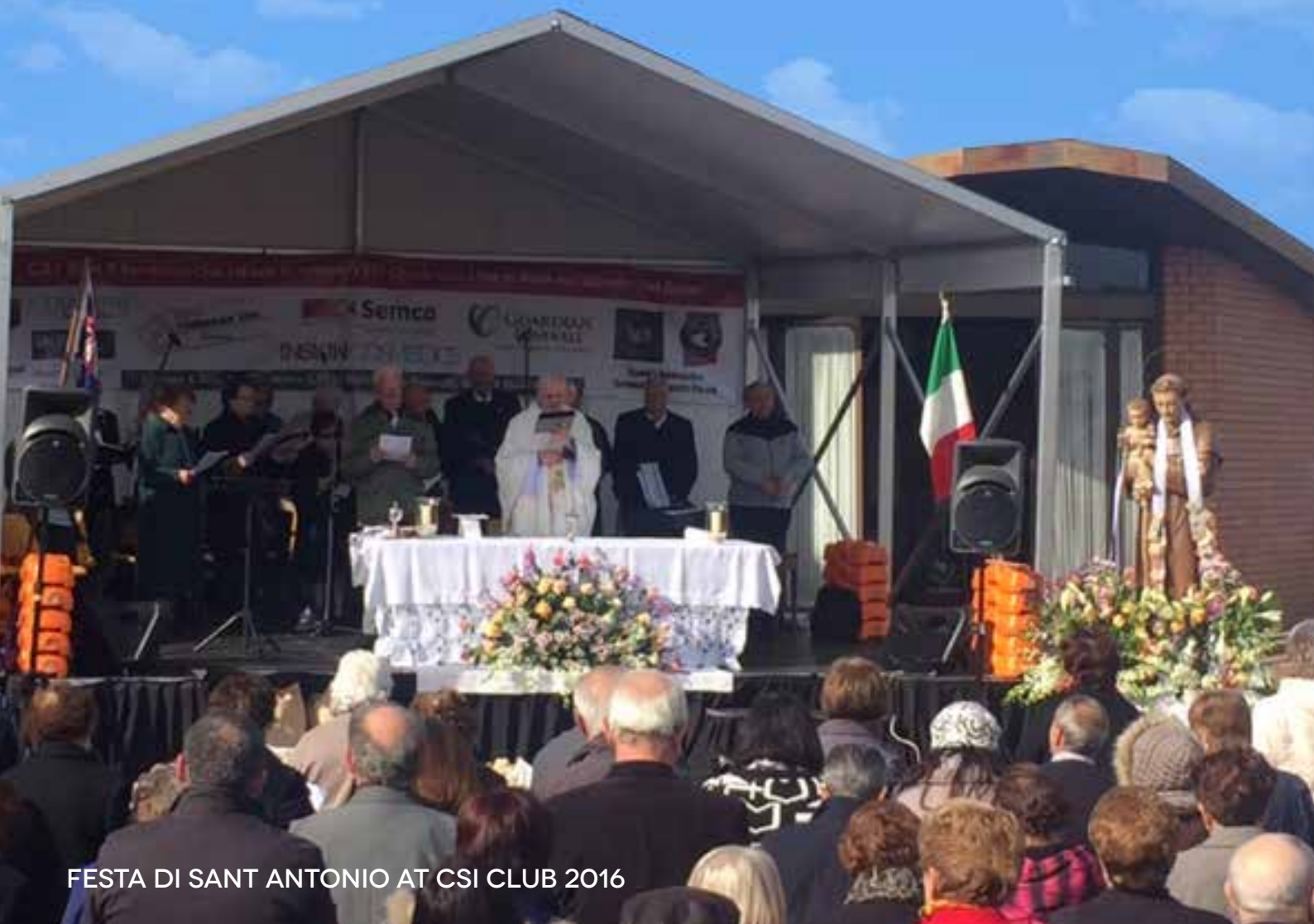
FESTA DI SANT ANTONIO AT CSI CLUB 2016